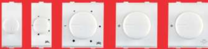
OL-411 OL-412 OL-421 OL-422 OL-424