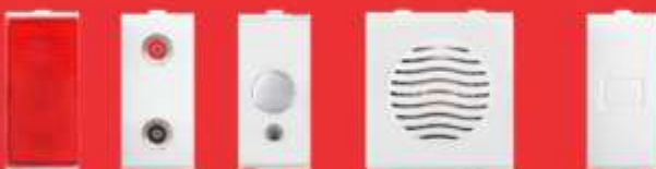
OL-611 OL-613 OL-614 OL-621 OL-711