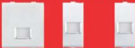
OL-522 OL-523 OL-528