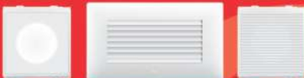
OL-824 OL-826 OL-827