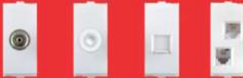
OL-512 OL-513 OL-514 OL-515