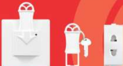
OL-821 OL-822 OL-823